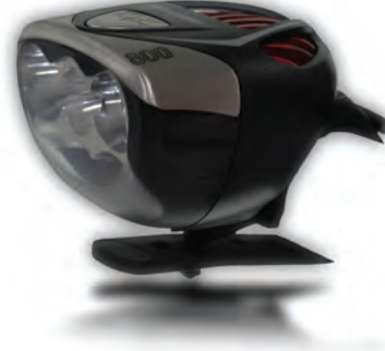
Figure 1b: Photo of Seca 800