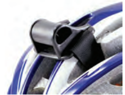
Figure 17: Mount tight on helmet.

The Helmet mount is designed to be mounted on any standard, vented bicycle helmet. Position the base of the helmet mount on top of the helmet, in the middle and slightly forward of center. Slide the hook and loop strap down through the proper vent, back up through the opposing vent, and finally through the slot in the base of the mount. Pull the strap tight and slide it back down the vent and affix it to the "loop" side of the strap inside the helmet (fig 17). Now install Seca just like you would on a handlebar (see instructions "Installing Seca onto your bike").