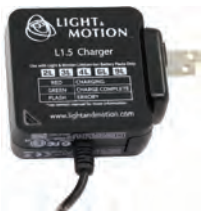
Figure 3a: Photo of Mini-L 1.5 Charger