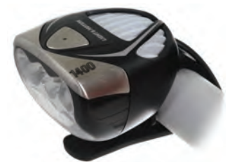
Figure 15: Seca on bar (strap over post).

To remove, simply release the strap from the locking post