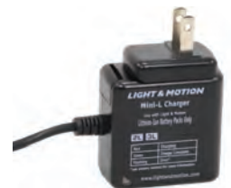
Figure 3a: Photo of Mini-L Charger