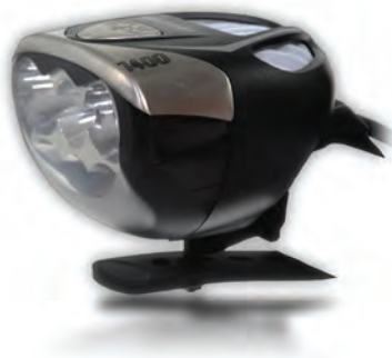
Figure 1a: Photo of Seca 1400