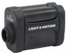
Figure 2a: Photo of 6Cell Li-ion battery