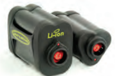
Figure 18: Battery Curve.

All Light & Motion batteries are designed to mount on a bicycle frame tube or seat post. Figure 18 shows battery curve on the 3-cell and 6-cell batteries which are designed to rest against a bicycle tube. Pull tightly on the strap and affix the end of the strap to itself via the hook-and-loop mounting surface. Wrap any excess around the battery until the entire strap is secured. There should be enough tension on the strap to prevent the battery from moving freely on the tube or seat post.