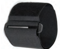
Figure 5: Velcro Battery Strap