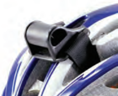
Figure 4: Helmet Mount