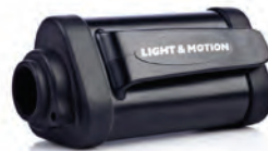
Figure 2a: Photo of 3Cell Li-ion battery